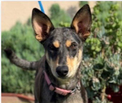
Kona 2-year old Female Catahoula Mix

The Love Joy Foundation is a non-profit organization that began working with the City in 2020, as a more cost effective vendor than other organizations to provide animal sheltering services to the City of Hawthorne.