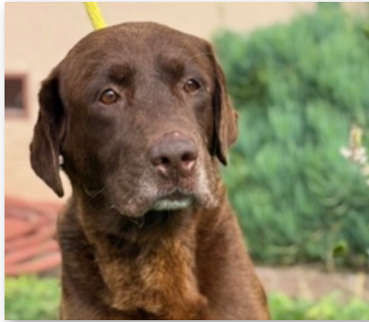
Mookie 3-year old Male Chocolate Lab