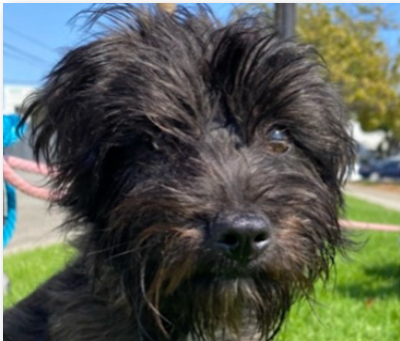
Cholo 4-month old Male Terrier and Poodle Mix