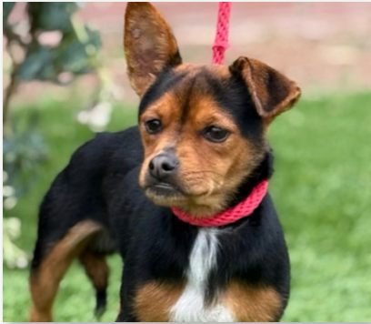
Broadway 5-year old Male Terrier Mix