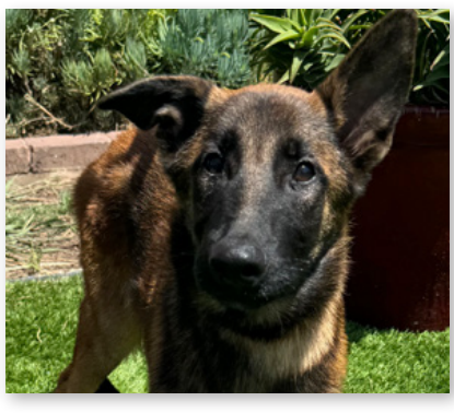
Moscow 5-month old Male Belgian Malinois