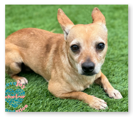
Sampson 5-year old Male Terrier Mix