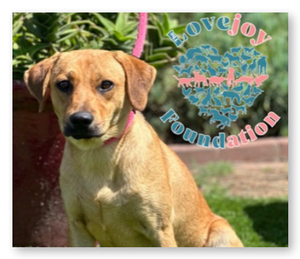
Raven Brothers 1-year old Male Dachshund and Lab Mix