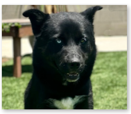
Debo 1-year old Male Shepherd Mix

The Love Joy Foundation is a non-profit organization that began working with the City in 2020, as a more cost effective vendor than other organizations to provide animal sheltering services to the City of Hawthorne.