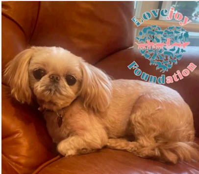
Kristy 8-year old Male Shih Tzu