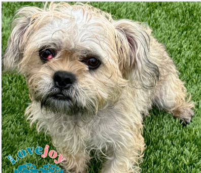
Mocai 1-year old Female Shih Tzu and Terrier Mix