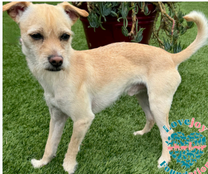
Mad Max 1-year old Male Terrier Mix

The Love Joy Foundation is a non-profit organization that began working with the City in 2020, as a more cost effective vendor than other organizations to provide animal sheltering services to the City of Hawthorne.