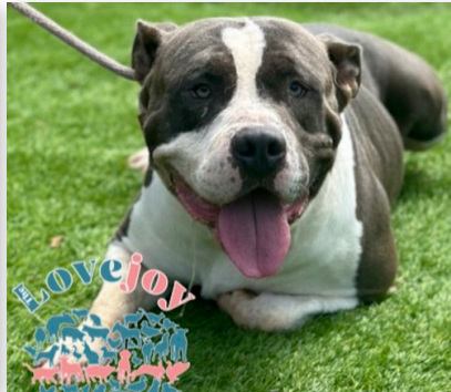
Saint 2-year old Male American Bully