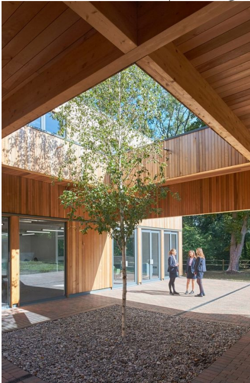
STUDENT CENTER, SURREY ENGLAND