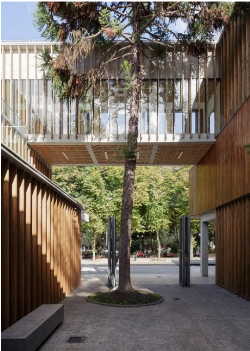
PUBLIC ADMINISTRATION BUILDING, CHILE