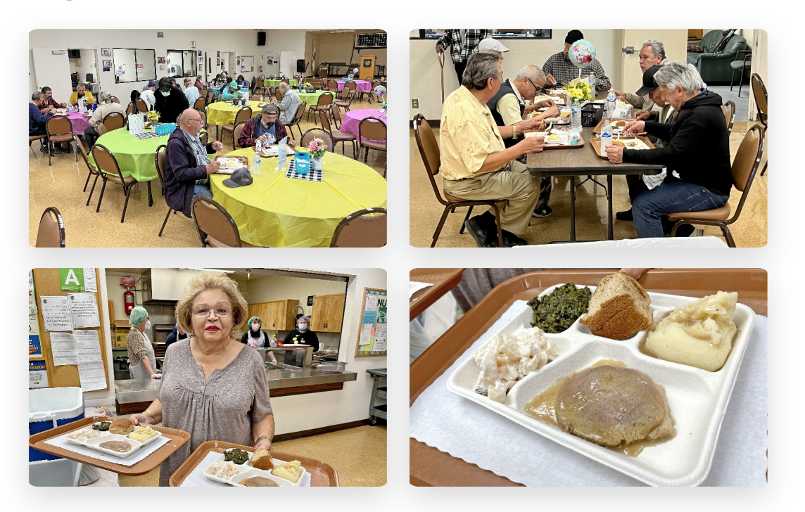
HCTV Video Link: https://youtu.be/nXqi9h3UR_8?t=512

The Hawthorne Senior Center held a grand opening to re-start the Senior Nutrition and Socialization Program! This program has been down for almost three years due to the pandemic. Over 50 seniors showed up to socialize with one another, something they have missed doing. They also got to enjoy a warm, tasty meal. The meal program is held Monday thru Friday from 11am until 1pm and the hot meals are served daily at noon. Space is limited, so make sure to call (310) 349-1652 to save a seat and have a meal ready for you!